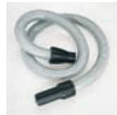
Standard treatment hose