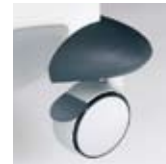
Wheel with brake

Zimmer Elektromedizin GmbH Junkersstraße 9 D-89231 Neu-Ulm Tel. +49. (0)7 31. 97 61-291 Fax +49. (0)7 31. 97 61-299 export@zimmer.de www.zimmer.de